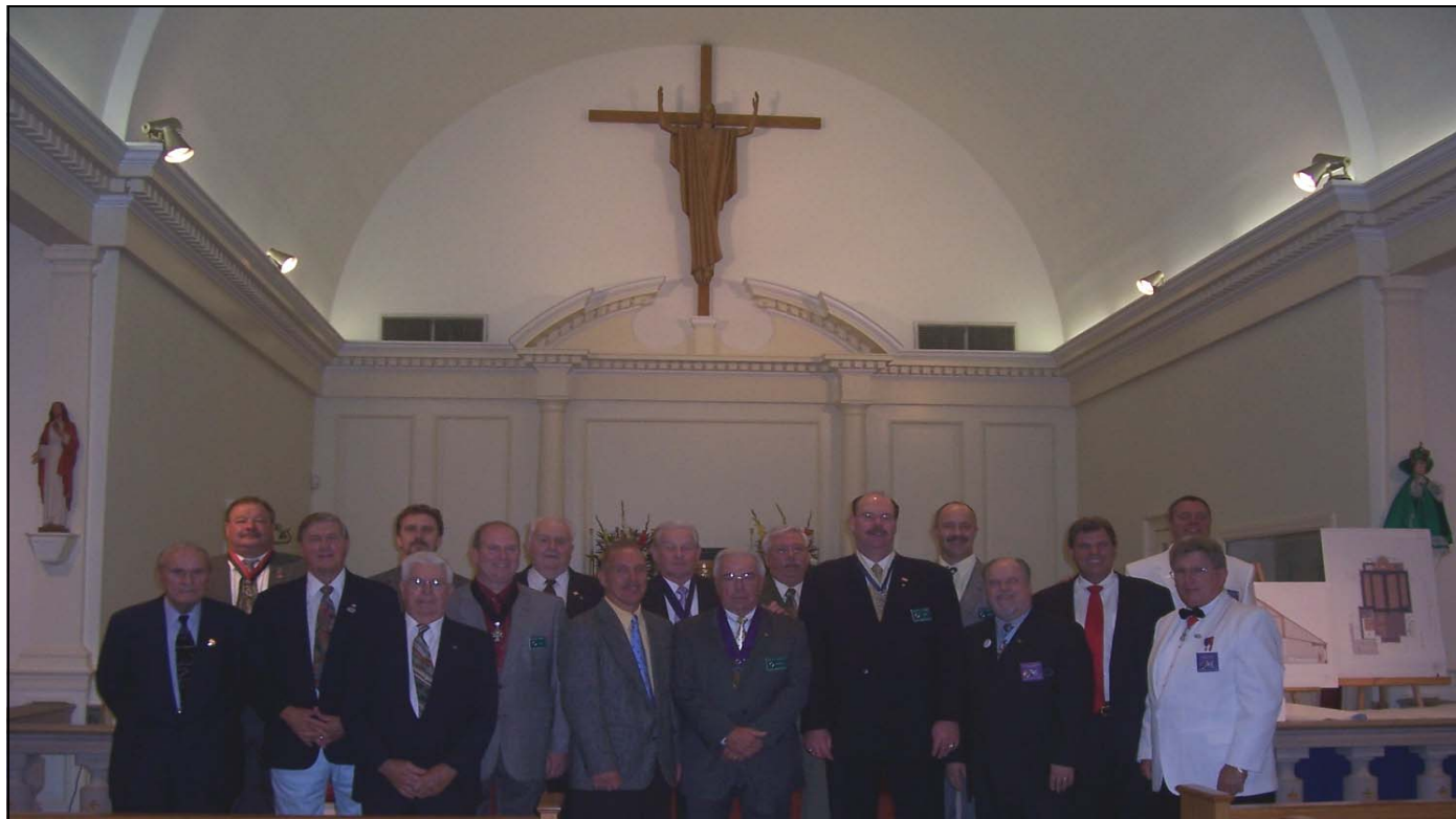
THE NEW COUNCIL OFFICERS WERE INSTALLED ON SUNDAY, AUGUST 19, IN A CEREMONY AFTER THE 5:00 P.M. MASS