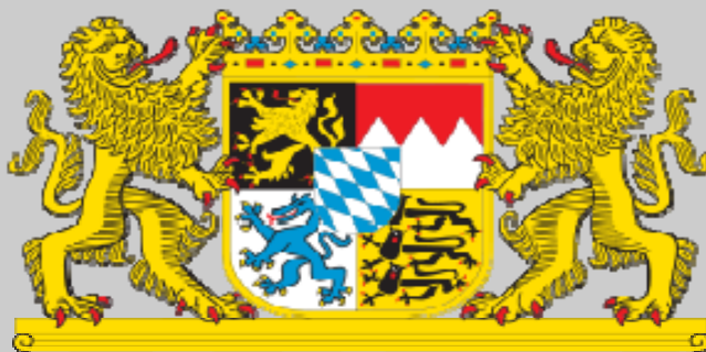
THE BAVARIAN COAT OF ARMS. BAVARIA, IN SOUTHERN GERMANY, IS THE HOME OF OKTOBERFEST

Tickets are $10 per person and will be sold after Masses and at the door. Tickets are limited to the first 200 people, and you must be 21 or older to attend. Lederhosen and funny Alpine hats are not required!